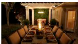
With "moonlight-effect" fixtures mounted high on the side

Travelers to mountainous or sparsely populated areas of the world often return to Long Island with glowing reports of night skies so clear it seemed they could almost touch the stars. It's a phenomenon rarely seen here because of overlighting and the misdirection of unshielded lighting. Such light pollution floods night skies, causing glare that diminishes the appearance of stars and planets.