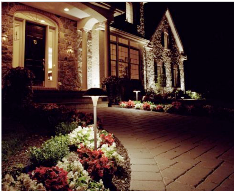
The owner of this Dix Hills house had lighting installed to create an intimate atmosphere that doesn't intrude on neighbors or wipe out the beauty of the night sky."